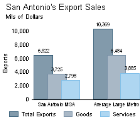
Brookings Institution analysis of various data for San Antonio, TX MSA

San Antonio produces $6.5 billion in total exports. As a share of its total economy, 7.8 percent of what it produces was exported in 2008, supporting 49,171 jobs. Recent export growth in San Antonio has been above average, expanding at 12.0 percent. Average wages in its largest export industry were $52,087, above the U.S. average. The metro has 5 export industry clusters. Finally, its major export industries are Transportation Equipment Manufacturing, Tourism, Business, Professional, and Technical Services, Chemical Manufacturing, and Royalties from Intellectual Property.